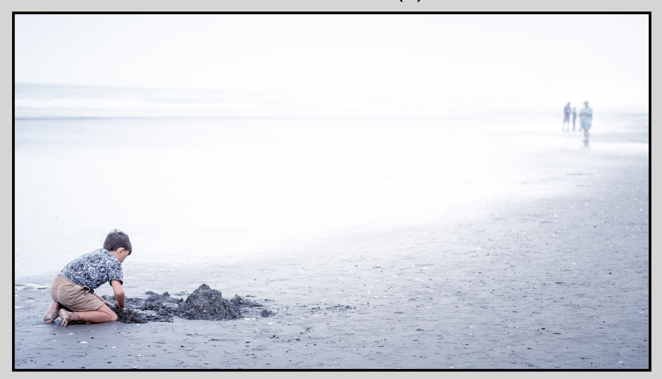
DIG - ALAN DANIEL

This was taken at Otaki Beach (NZ) during the annual International Kite Festival a few weeks ago. With a light breeze and an overcast sky the conditions were perfect for kites and perfect for cameras. The broad, endless stretch of beach left plenty of room for the kite enthusiasts and for the spectators - of which there were many. It seemed half of Wellington had come out to watch the spectacle. The sky was full of colour, the beach was full of people and everyone was looking up in amazement at the intricate, imaginative kites.