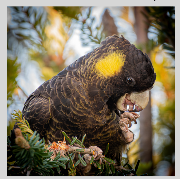
LADY YELLOW TAIL - GEOFF ATWOOD