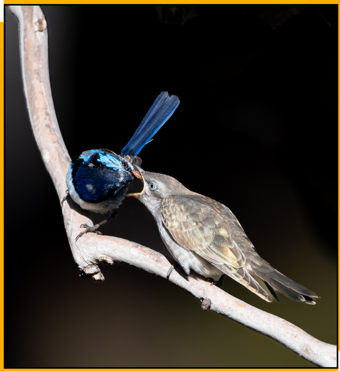
PROBLEM CHILD - GEOFF ATWOOD