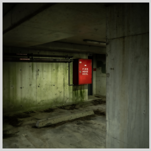
A NIGHT OUT WITH FRIENDS - GREG PITTY